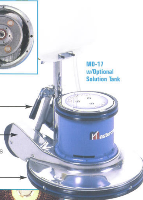
MD-17 w/Optional Solution Tank